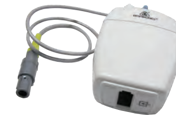
LoFlo Sidestream EtCO2 Sensor Item Code: B-RSCO2 Warranty: 2 years