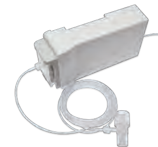
Dual Gas Sidestream EtCO2 Module Item Code: DG-SENSOR Warranty: 2 years