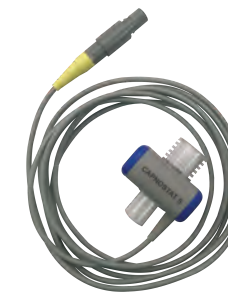
Capnostat Mainstream EtCO2 Sensor Item Code: B-RMCO2 Warranty: 2 years

Optimize patient safety with our advanced capnography technology. Our EtCO2 monitoring solutions offer seamless integration, providing accurate real-time readings during surgery and making it easy for clinical-decision making during procedures.