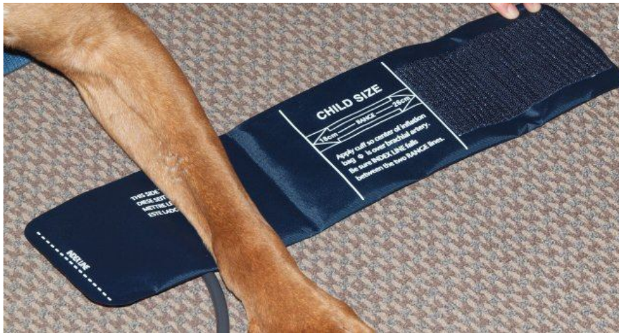
Child cuff showing Index Line and Graduated Scale

The cuffs are all graduated so you can easily find the correct sized cuff to use. There is an index point marked on the leading edge of the cuff. When wrapped around the limb, this index point must be within the graduated scale.