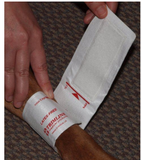
Cuff is correct size.